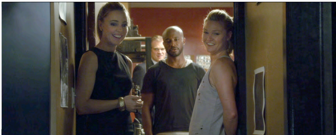
Melissa George, David Harbour, Taye Diggs and Julia Stiles in Between Us