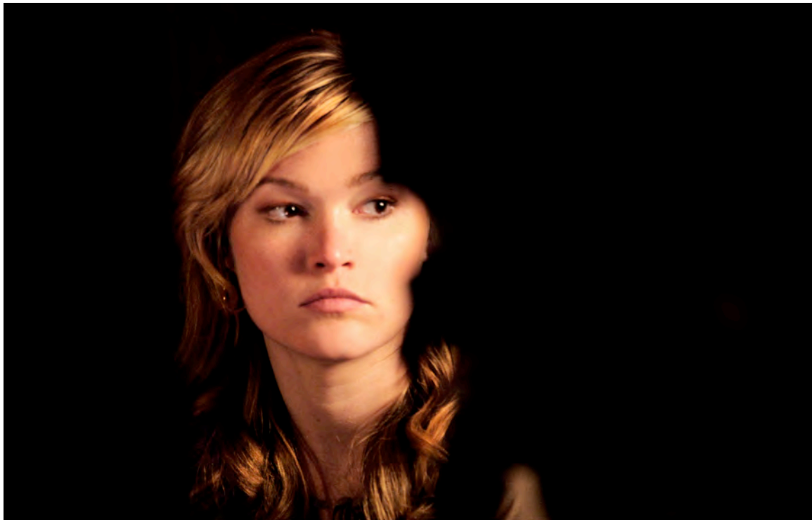
Julia Stiles in Between Us