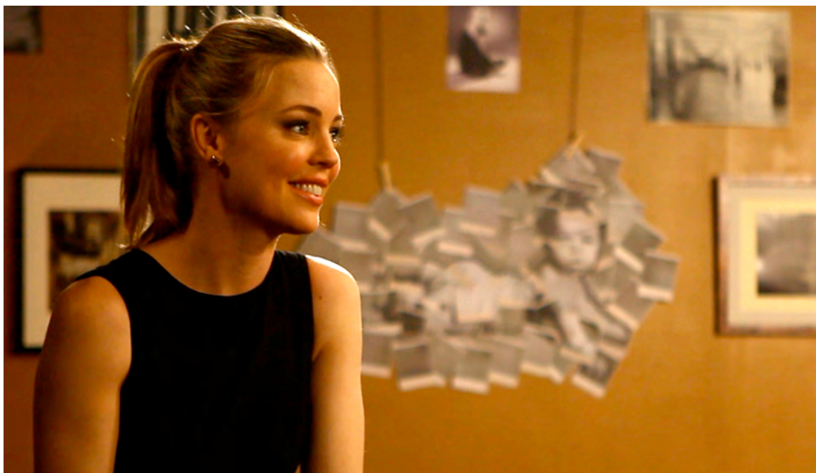
Melissa George in Between Us

©2013 Bugeater Filmed Entertainment, LLC