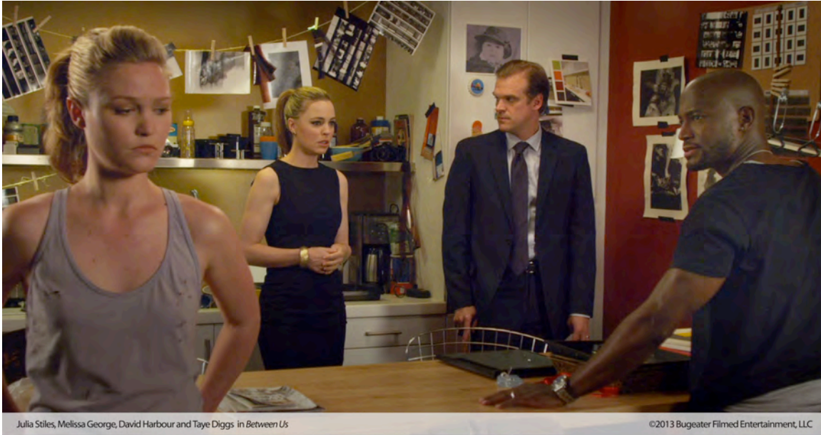
Julia Stiles, Melissa George, David Harbour and Taye Diggs in Between Us