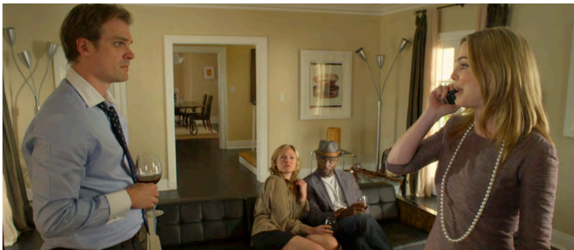
David Harbour, Julia Stiles, Taye Diggs and Melissa George in Between Us

©2013 Bugeater Filmed Entertainment, LLC