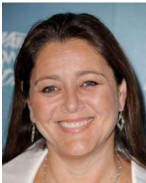
CAMRYN MANHEIM “Florie”