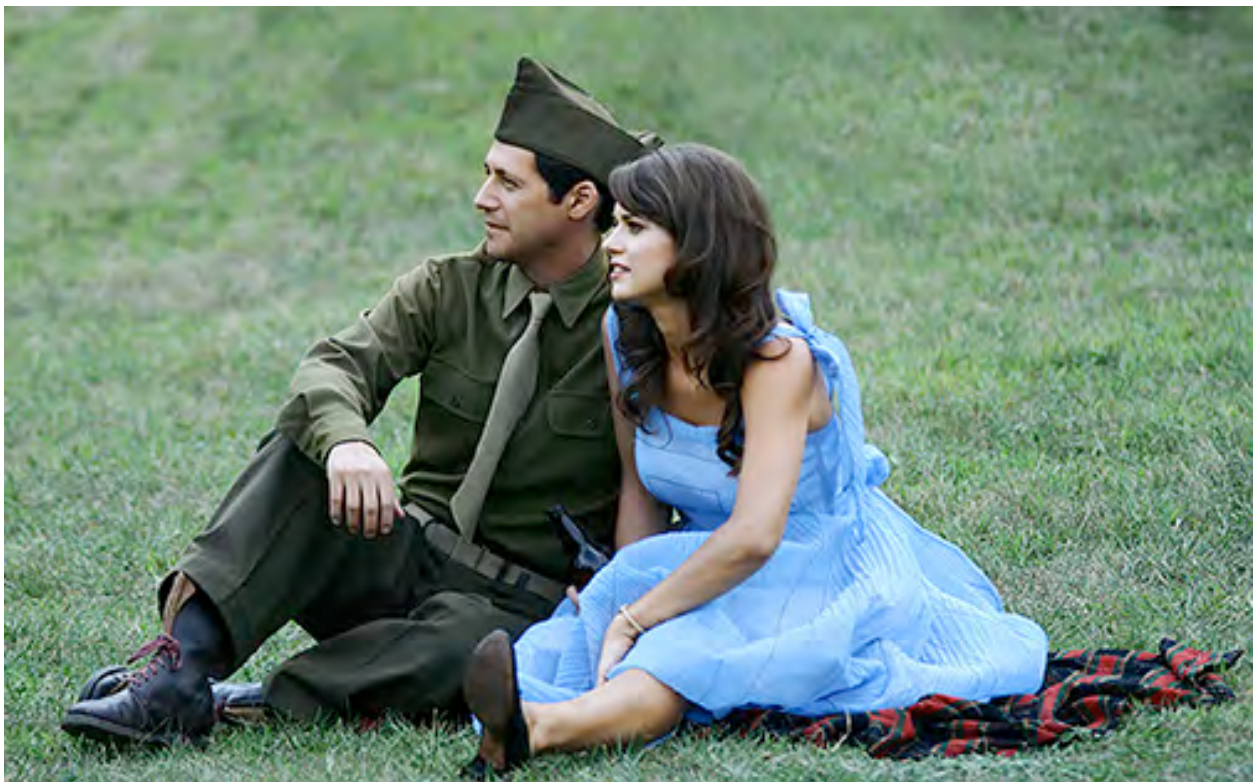
Andy Hirsch as Sam Dolnick & Lyndsy Fonseca as Anna Gerkey in Fort McCoy