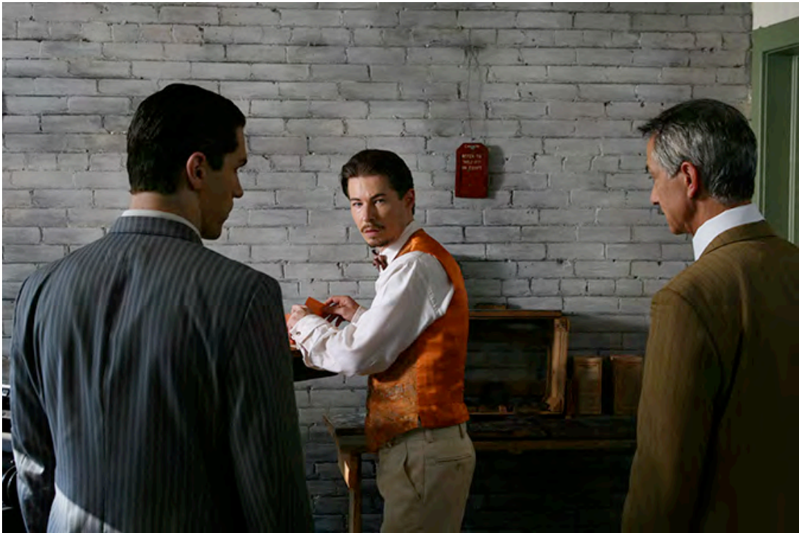
Eugenio Ravarini ( Sam Witwer ), Carlo Tresca ( Edoardo Gero ) and William J. Flynn ( David Strathairn ),