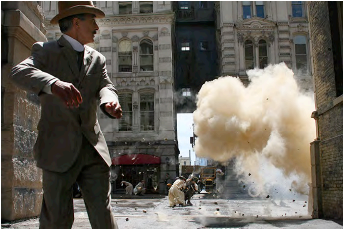
William J. Flynn ( David Strathairn ),