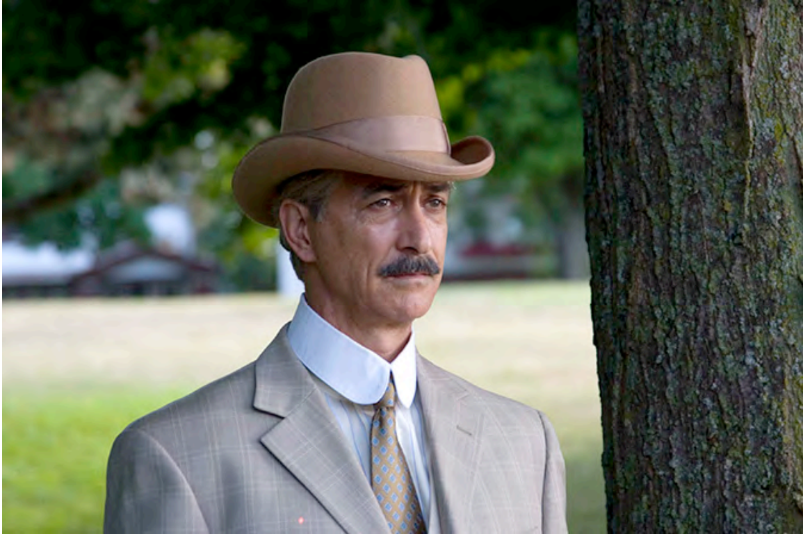
William J. Flynn ( David Strathairn )