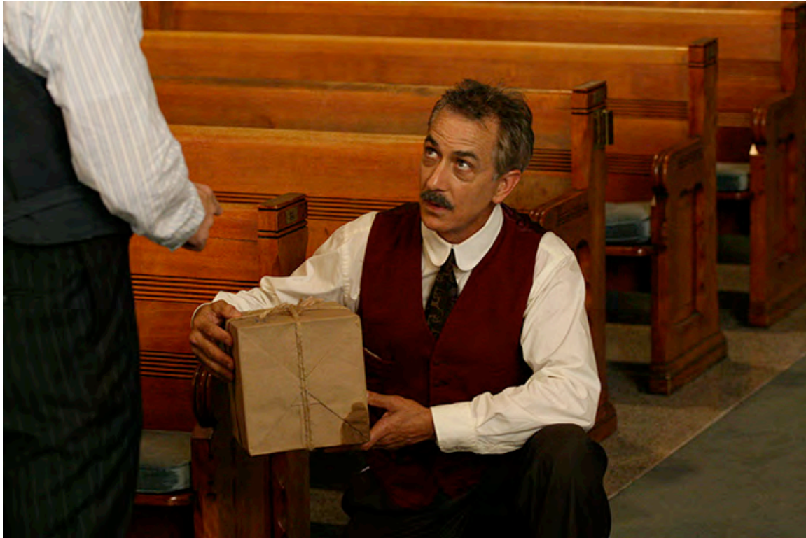
William J. Flynn ( David Strathairn )