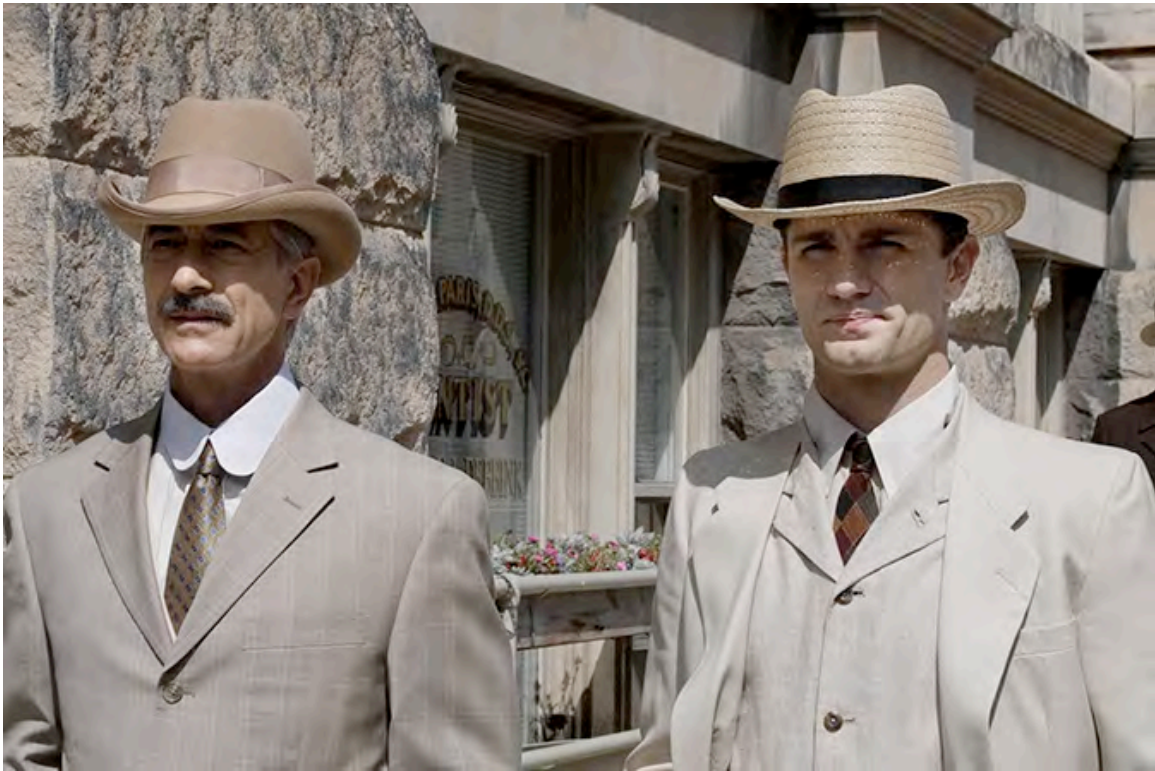
William J. Flynn ( David Strathairn ), Eugenio Ravarini ( Sam Witwer )